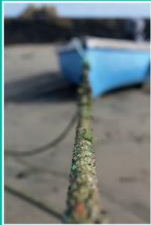
'Hold Tight.' 2020 winner of the Special Recognition prize KS3.