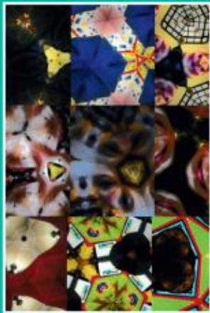
'Faces of Fun.' 2015 1st place winner KS1&2.