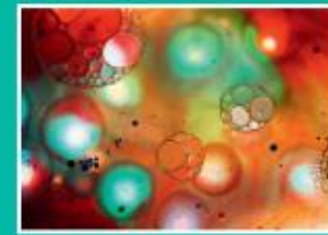
'The Start of Life's Journey.' 2021 Joint 1st place winner KS3.