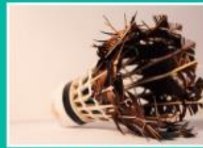
'The Retired Shuttlecock.' 2021 1st place winner KS4.