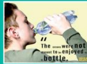
'This Globe My World.' 2018 2nd place winner KS3.