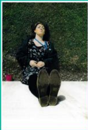
'Edge of the World.' 2017 Joint 2nd place winner KS1&2.