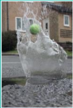
'Bouncing Back.' 2019 1st place winner KS3.