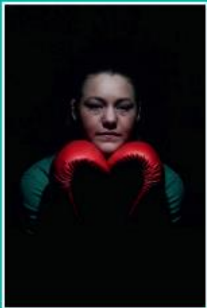
'To Love, Not Fight.' 2016 2nd place winner KS4.