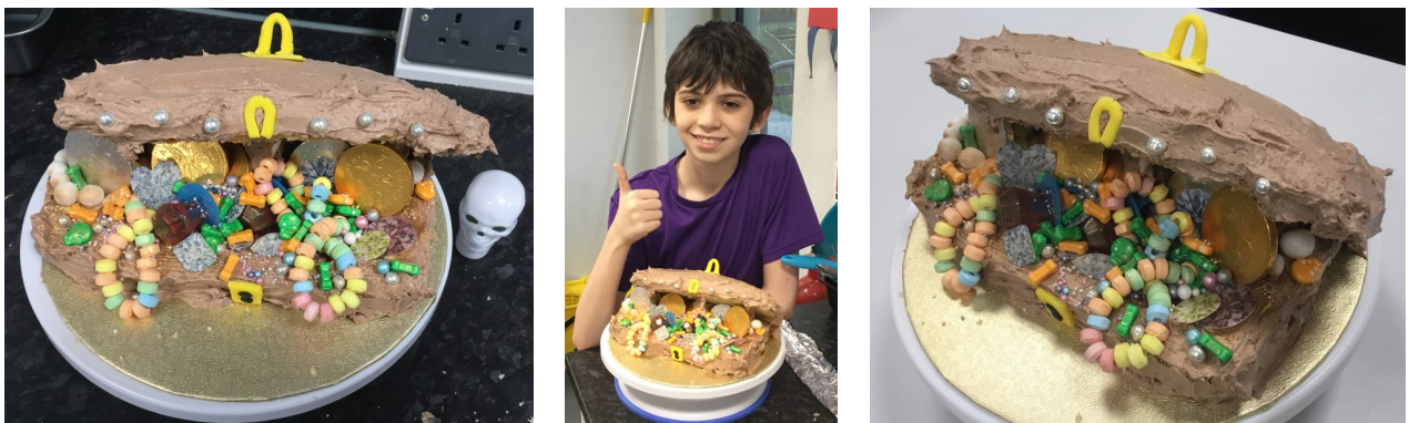
Charlie's treasure chest cake!